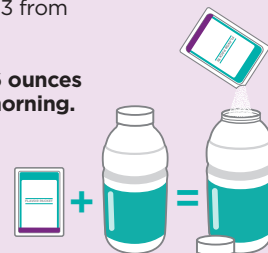
Bottles and packets not shown actual size.

IMPORTANT: Continue to consume only clear liquids until colonoscopy. Stop drinking liquids at least 2 hours prior to colonoscopy.