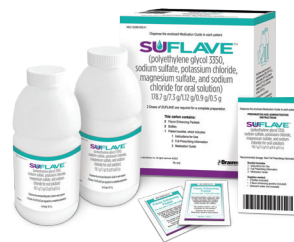
Bottles and packets not shown actual size.

To learn more about this product, please call 1-800-874-6756.